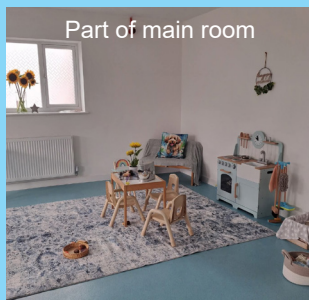
Part of main room

Please email sunnybrowplayschool@gmail.com for more information.